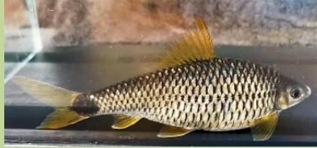
Crossocheilus reticulatus Luke Brown 83 pts