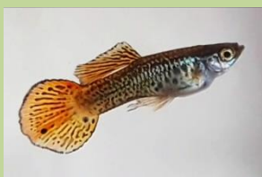
2 Roundtail Guppy 84 Alan Stevens