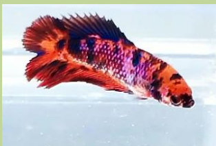
2 Betta splendens 79 Female Double Tail Maria Ornberg