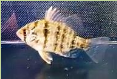
2 Enneacanthus chaetodon 76 Stuart Brown