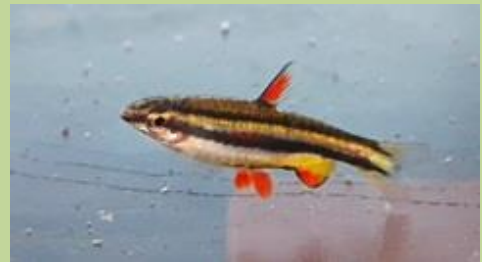
4 Nannostomus marginatus 80 Alan Stevens

Group B Cultivated Tropical Egglayers judged by Dawn Pearce