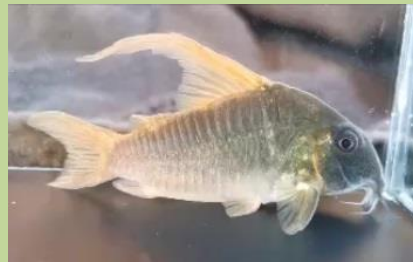
3 Corydoras concolor 81 Stuart Brown