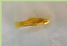
3 Xiphoporus pygmaeus 90 Kevin Sciberras