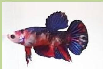
3 Betta splendens 78 Multi-color Plakat Alan Stevens