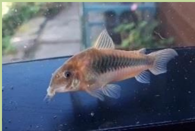
Corydoras aeneus 82