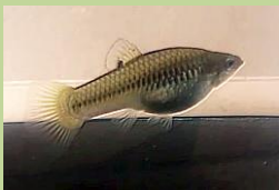
2 Limia perugiae 91 Eddie Wade