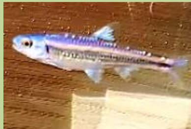
3 Notropis chrosomus 75 Stuart Brown