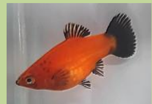
4 Red Wagtail Platy Alan Stevens