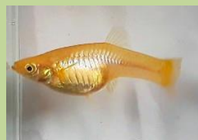
3 Gold Natural Tail (female) Alan Stevens